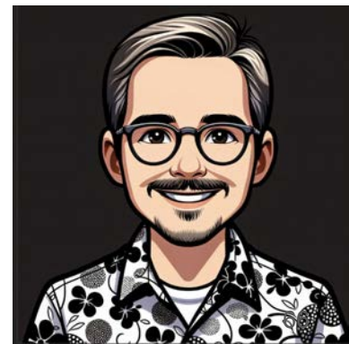
Here is a cartoon version of the image you provided.